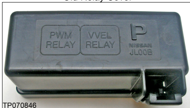
Old Relay Cover

NOTE: Remove and replace the relay box upper cover shown in Figure 1 with the relay box upper cover listed in the Parts Information section of this bulletin and displayed in Figure 2.