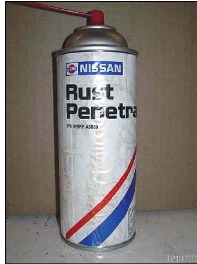
Nissan Rust Penetrant P/N 999MP-A3020